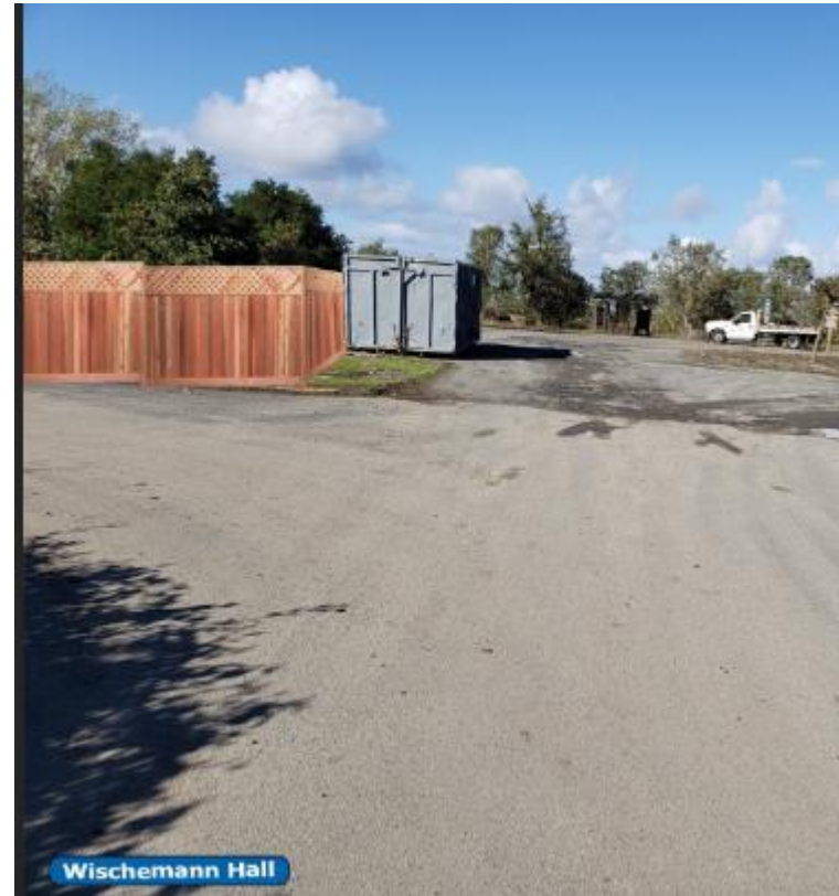
View from Entry Driveway