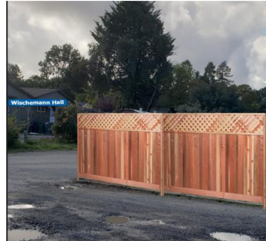
View from Community Center